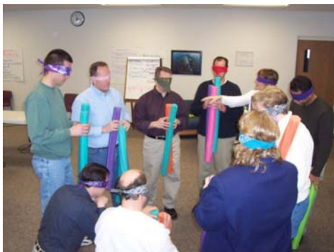
Foster collaboration and build trust

The one-day overview introduces the key practices, giving participants the opportunity to learn about exemplary leadership. It does provide a solid foundation, as well as appropriate direction for participants to take their leadership development.